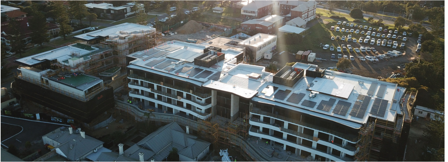
Marine Views Cottesloe and Waterfront Cottesloe - August 2021

Thanks to our construction team Built, we are able to show you this wonderful aerial view of our development.