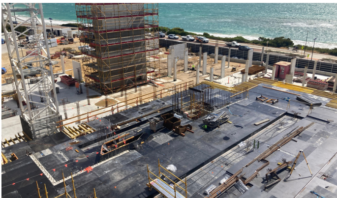
Ground level formwork board in place

We have signed off on the very last stage of the heritage building works. The structural reinforcement has been completed, and the roofing will be replaced this coming month. We are very excited to see the scaffolding come down from the heritage buildings in early 2023. The fit-out will be painstakingly slow, and we expect works to be finalised early 2024. It will be well worth the wait!