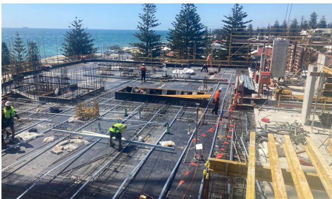
Level 3 looking north west