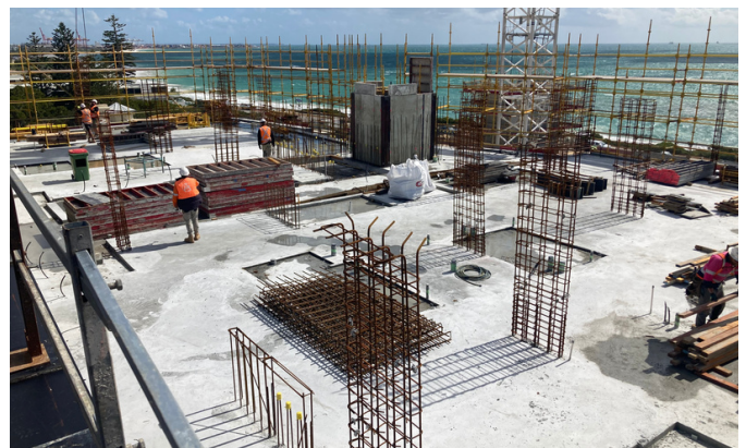
Preparing formwork on Level 3 slab for installation of columns